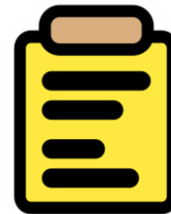
CQC Inspection 30 th November 2015.